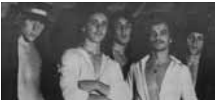
1978 ATTIC promo