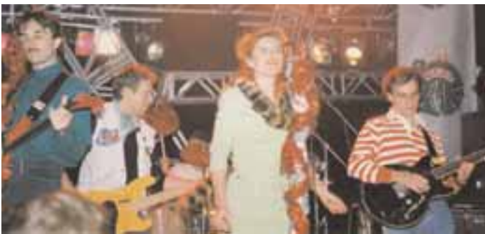
The Slime Dogs opening for the Tragically Hip - 1990